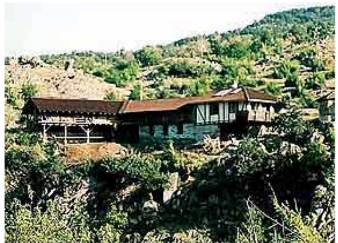
Pilot Ark and Rescue Centre Vlahi in Bulgaria

The final report will provide information on the improved state of in situ conservation of animal genetic resources in Europe. It will show how Ark and Rescue Centres operate, explain how the Database can be used and also show the work completed and that still to be done. This report will be made public in order to promote the work of ELBARN. As part of the promotion of ELBARN, the Area Action Plans will be presented to governments, in order to communicate the need for action and to show how to achieve successful in situ conservation.